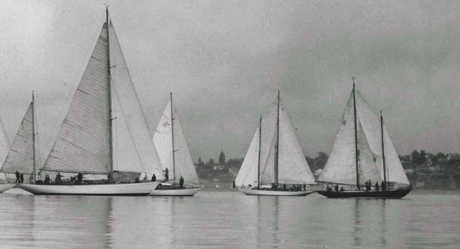
Swiftsure 1948, left to right: Dorade, Circe, Swiftsure, Maruffa, Owens Cutter, Red Jacket and Alatola.