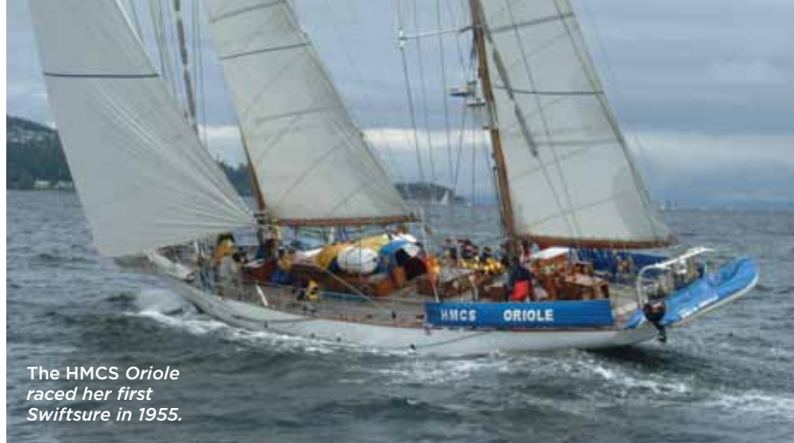
The HMCS Oriole raced her first Swiftsure in 1955.

THE ROYAL CANADIAN NAVY has added greatly to Swiftsure's success. Already in